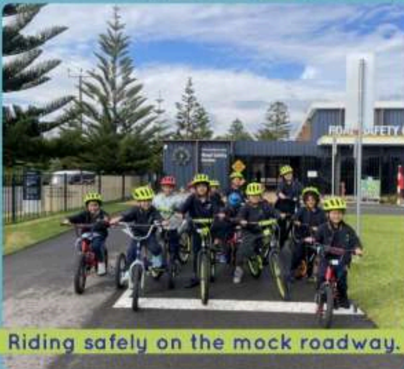
Riding safely on the mock roadway.