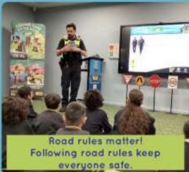
Road rules matter! Following road rules keep everyone safe.

Last week IELP had the exciting opportunity to visit the SAPOL Road Safety Centre and learn how to stay safe on the Australian road.