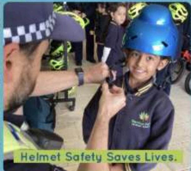
Helmet Safety Saves Lives.